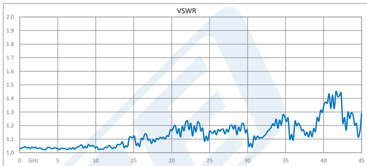
Typical Performance Data

Click the following link (or enter part number in "SEARCH" on website) to obtain additional part information including price, inventory and certifications: 2.92mm Male to 2.92mm Male Cable 24 Inch Length Using PE-118SR Coax PE3W07491-24