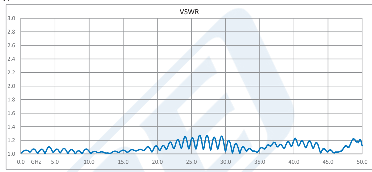
Test data taken with 2 connectors on both ends of test fixture