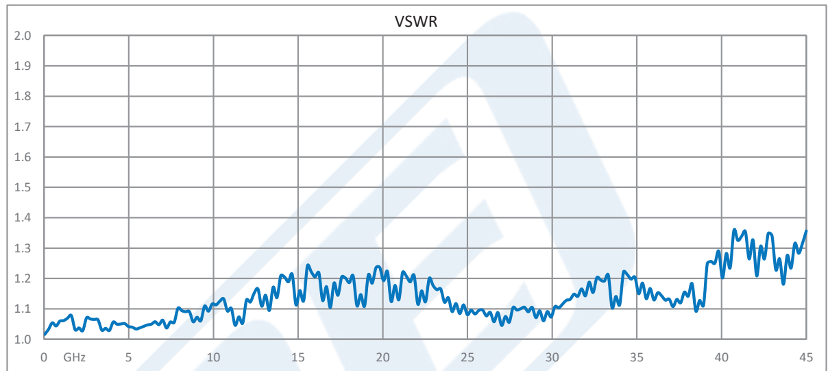
Typical Performance Data

Click the following link (or enter part number in "SEARCH" on website) to obtain additional part information including price, inventory and certifications: 2.92mm Male to 2.92mm Male Low Loss Cable 24 Inch Length Using PECX006 Coax PE3C6493-24